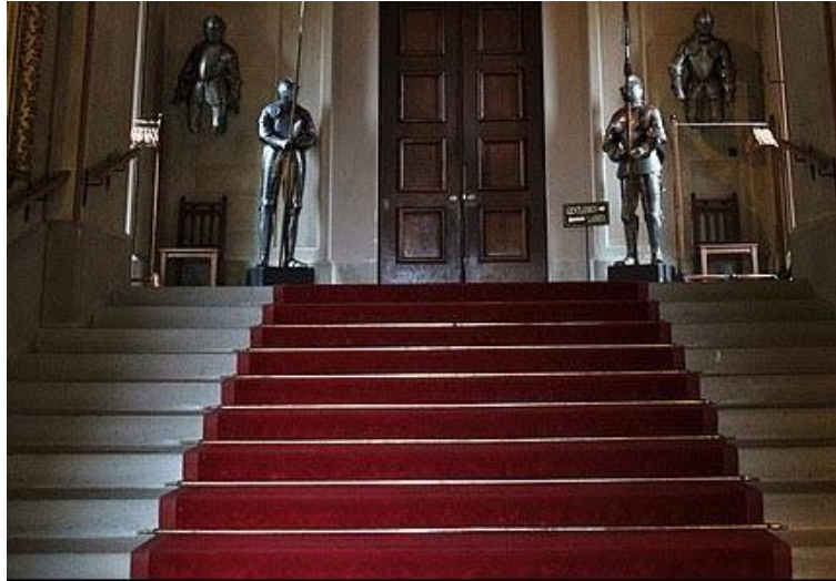
The entrance steps into the Castle

approximately 45 degrees prior to levelling out as it climbs the stairs. When the stair-climber climbs the stairs, the visitor may feel a slight bump as it travels over the individual steps. Unfortunately, we do not have hoist facilities.