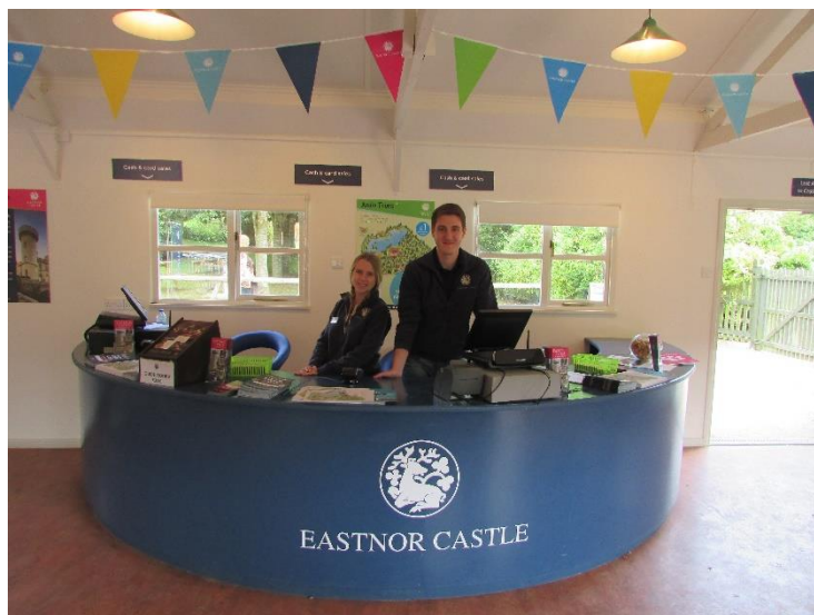
The counter in the Visitor Entrance