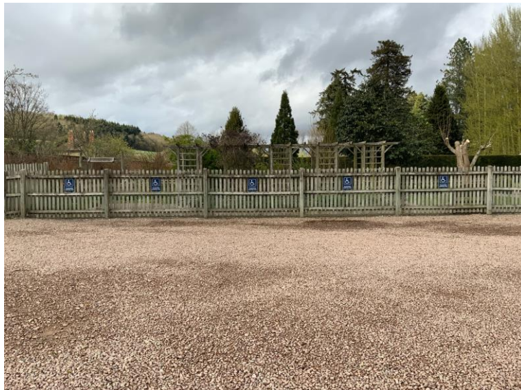
Accessible Parking Bays